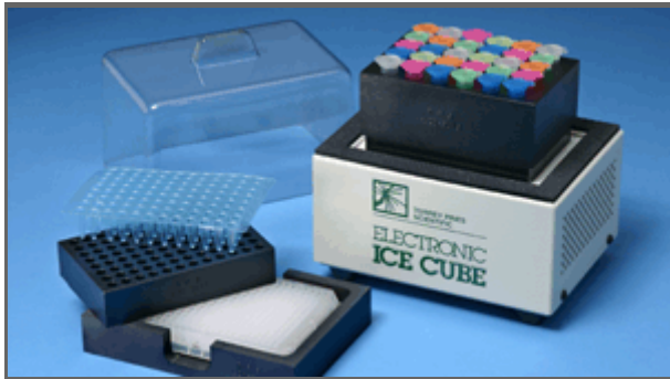
ECHOtherm™ Model IC10 Electronic Ice Cube